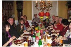
Group members braved a snowy night in Nevillewood to enjoy a festive Chinese New Year celebration.